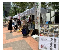
Outdoor market events, etc. at commercial facilities