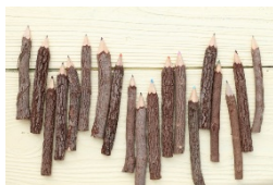
Wood Education activities

We will host various fun events to provide children in urban areas with the opportunity to think about the global environment (wood education workshops, creation of novelty goods using domestic timber and thinned wood, etc.).