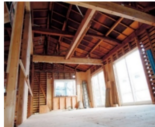
Interior stripped down to its main frame