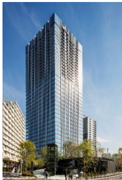
Sumitomo Fudosan Shinjuku Garden Tower