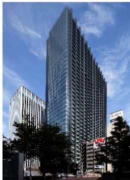
Sumitomo Fudosan Shinjuku Grand Tower