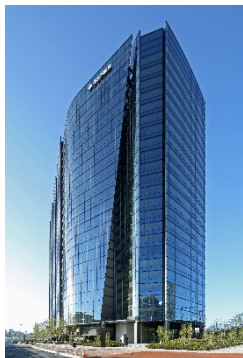
Sumitomo Fudosan Osaki Garden Tower