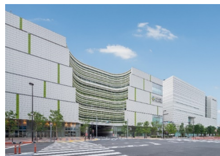
<Ariake Garden facade>