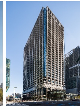
Tokyo Nihombashi Tower