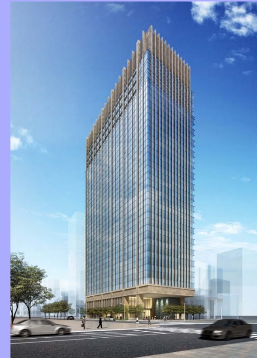
Sumitomo Fudosan Onarimon Tower